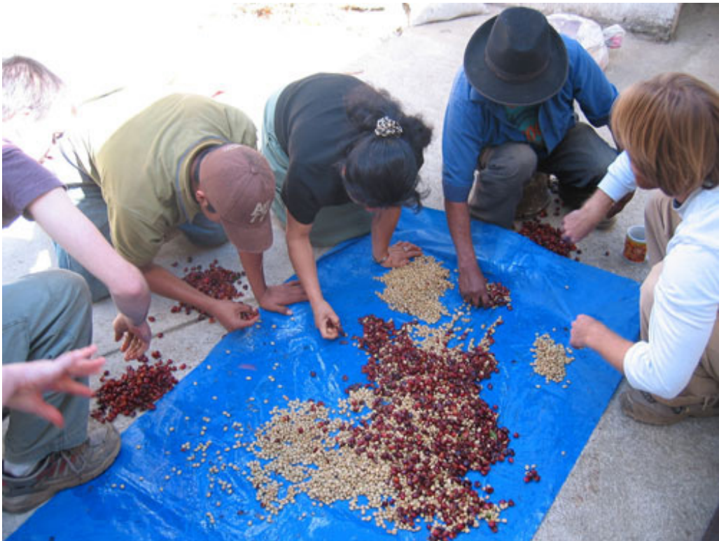
Figure 2: Sorting coffee beans.

The farmers work tirelessly to ensure that their families have sufficient corn to eat and that their coffee meets the cooperative's high standards of quality. The members of La Voz refer to their coffee trees as their "children" who they have lovingly tended for decades. High-quality, organic coffee production is time consuming and arduous—it requires almost daily attention. During the coffee harvest between December and March, wives, husbands, and children work together to pick the coffee cherries by hand as they ripen and carry them to the wet mill each afternoon.