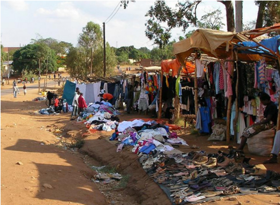
Figure 3: Roadside Salaula trader, Zambia.

for other activities or as a sideline business. Hansen found that there were slightly more female sellers and that women were more likely to be single heads of households. Successful salaula trading requires business acumen and practical skills. Flourishing traders cultivate their consumer knowledge, develop sales strategies, and experiment with display and pricing. While salaula trading has relatively low barriers to entry (one simply has to purchase a bale of clothing from a wholesale importer in order to get started), in this informal market scale is important: salaula moves best when traders have a lot of it on offer. Traders also have to understand the local cultural politics in order to successfully earn a living in this sector. For example, salaula is different from used clothing from people someone knows. In fact, secondhand clothing with folds and wrinkles from the bale is often the most desirable because it is easily identifiable as “genuine” salaula. 16