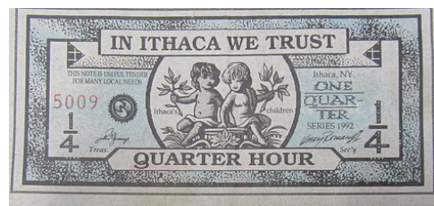
Figure 5: An Ithaca Hour note.

The anthropologist Faidra Papavasiliou studied the impact of the Ithaca HOURS currency system. She found that while the complementary currency does not necessarily create full economic equality, it does create deeper connections among community members and local businesses, helping to demystify and personalize exchange (much as we saw with the lobstermen and dealers). 44 The Ithaca HOURS system also offers important networking opportunities for locally owned businesses and, because it provides zero interest business loans, it serves as a form of security against economic crisis. 45 Finally, the Ithaca HOURS complementary currency system encourages community members to shop at locally owned businesses. As we will see in the next section, where we choose to shop and what we choose to buy forms a large part of our lives and cultural identity. The HOURS system demonstrates a relatively successful approach to challenging the inequalities fostered by general purpose money.