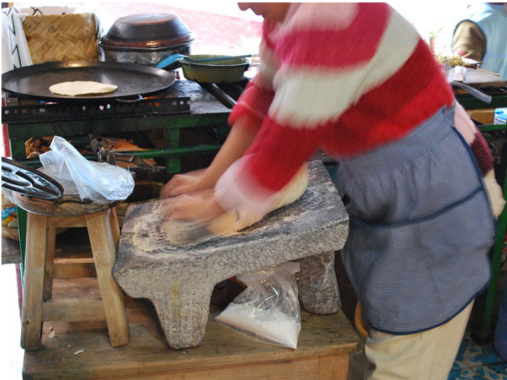
Figure 1: Woman grinding corn with a metate.

and parts of Central America, many indigenous people primarily make their living through small-scale subsistence maize farming. Subsistence farmers produce food for their family's own consumption (rather than to sell). In this family production system, the men generally clear the fields and the whole family works together to plant the seeds. Until the plants sprout, the children spend their days in the fields protecting the newly planted crops. The men then weed the crops and harvest the corn cobs, and, finally, the women work to dry the corn and remove the kernels from the cobs for storage. Over the course of the year mothers and daughters typically grind the corn by hand using a metate , or grinding stone (or, if they are lucky, they might have access to a mechanical grinder). Ultimately, the corn is used to make the daily tortillas the family consumes at each meal. This example demonstrates how the domestic mode of production organizes labor and daily activities within families according to age and gender.