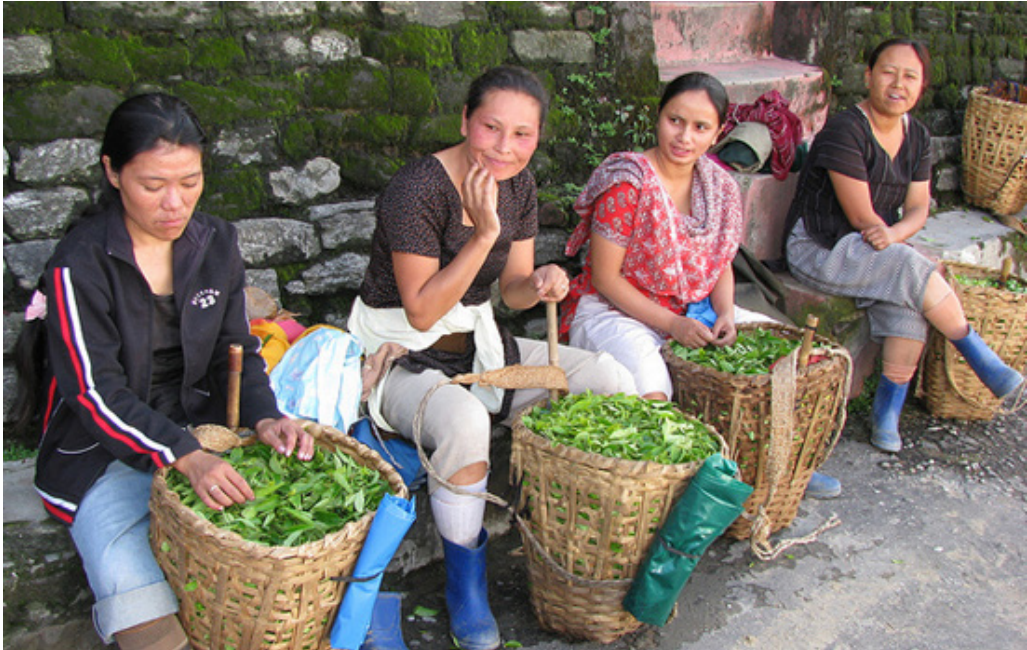
Figure 6: Tea Workers in Darjeeling, India.

from Kentucky, Mezcal can only be produced in certain parts of Mexico, and sparkling wine can only be called champagne if it originated in France. Similarly, in order to legally be sold as “Darjeeling tea,” the tea leaves must come from the Darjeeling district of the Indian state of West Bengal.