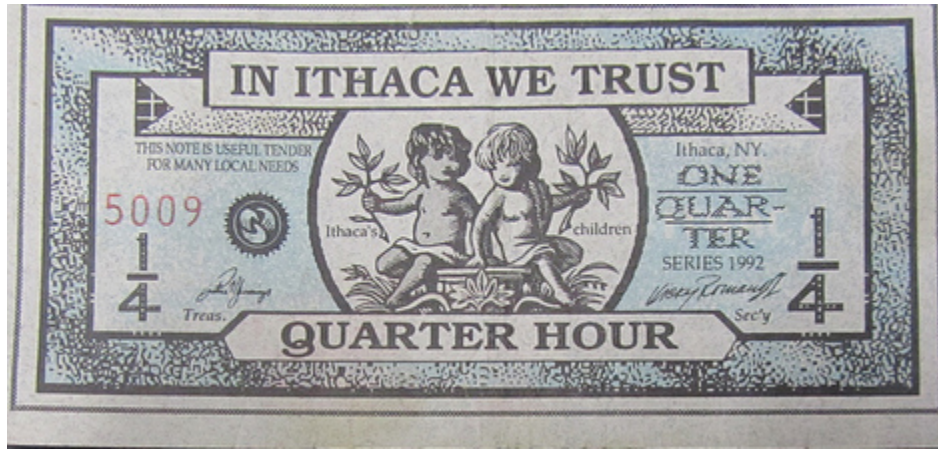
Figure 5: An Ithaca Hour Note

The anthropologist Faidra Papavasiliou studied the impact of the Ithaca HOURS currency system. She found that while the complementary currency does not necessarily create full economic equality, it does create deeper connections among community members and local businesses, helping to demystify and personalize exchange (much as we saw with the lobstermen and dealers). 44 The Ithaca HOURS system also offers important networking opportunities for locally owned businesses and, because it provides zero interest business loans, it serves as a form of security against economic crisis. 45 Finally, the Ithaca HOURS complementary currency system encourages community members to shop at locally owned businesses. As we will see in the next section, where we choose to shop and what we choose to buy forms a large part of our lives and cultural identity. The HOURS system demonstrates a relatively successful approach to challenging the inequalities fostered by general purpose money.