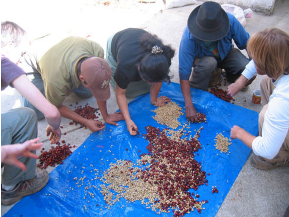
Figure 2: Sorting Coffee Beans

The farmers work tirelessly to ensure that their families have sufficient corn to eat and that their coffee meets the cooperative's high standards of quality. The members of La Voz refer to their coffee trees as their "children" who they have lovingly tended for decades. High-quality, organic coffee production is time consuming and arduous—it requires almost daily attention. During the coffee harvest between December and March, wives, husbands, and children work together to pick the coffee cherries by hand as they ripen and carry them to the wet mill each afternoon.