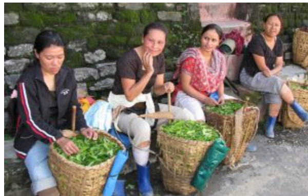
Figure 6: Tea Workers in Darjeeling, India

The anthropologist Sarah Besky researched Darjeeling tea production in India to better understand how consumer desires are mapped onto distant locations. 61 In India, tea plantation owners are attempting to reinvent their product for 21st century markets through the use of fair-trade certification (discussed earlier in this chapter) and Geographical Indication Status (GI). GI is an international property-rights system, regulated by the World Trade Organization, that legally protects the rights of people in certain places to produce certain commodities. For example, bourbon must come from Kentucky, Mezcal can only be produced in certain parts of Mexico, and sparkling wine can only be called champagne if it originated in France. Similarly, in order to legally be sold as "Darjeeling tea," the tea leaves must come from the Darjeeling district of the Indian state of West Bengal.