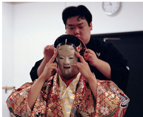
Figure 6: Actor donning mask at a Noh workshop in Copenhagen, Denmark, 2010.

Rehearsal and training instill an embodied understanding of the art's form and technique in the performer, and adherence to the forms gives performances their versatility and longevity. 43 Techniques thus serve as a conservative force within a performance genre as each generation