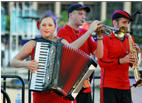
Figure 8: Street performance in Sydney, Australia, 2010.

Linked to the audience, then, is the setting. Experiencing a performance of Romeo and Juliet outdoors under a tent is very different from experiencing the same play in a historic theater like The Globe in London (a reproduction of the Elizabethan-era theater where many of William Shakespeare's plays were staged). The setting is important not only for context but for access. Performances in public parks or downtown squares (e.g. Figure 8) are accessible to all while performances at theaters and opera halls (e.g. Figure 9) are limited to people who have time and money to spend on such luxuries. Similarly, and as discussed previously, visual cues in a performance space are often important signals that a performance is occurring. If you see a couple in a park arguing loudly, wildly gesticulating, and drawing bystanders into their conflict, you may have stumbled onto an avant-garde theater production, but the lack of framing (no stage, curtains, or formal audience seats) makes the scene ambiguous. It may be only a couple arguing.