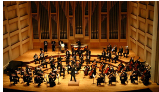
Figure 9: Dublin Philharmonic performing at the Blumenthal Performing Arts Center in Charlotte, NC, 2009.

Clearly, then, there are many possible outcomes of a performance. Some are staged simply for entertainment, which is an important component of human life. Often, though, there are additional motivations behind the creation and performance. For example, a performance can be used to assert the distinctiveness of a particular ethnic group or to argue for racial harmony in a nation-state. Carla Guerron-Montero described such performances in Panama, which gained its independence from Colombia in 1903. 57 The United States assisted the Panamanian separatist movement and participated in building the Panama Canal shortly thereafter. To distinguish themselves from Colombians and from U.S. citizens in Panama, middle-class intellectuals in Panama have consistently looked to Spain as the legitimate source of their identity. In this romanticized view, the ideal Panamanian is a rural, Hispanic (Spanish and indigenous) peasant, and peasant forms of dress (the pollera ) and music (the tipica ) are used to symbolize a unified national identity of pride in being a racial democracy. Along