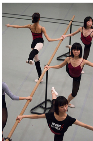
Figure 7: Ballet dancers warming up before Prix de Lausanne , 2010.

The pressure felt by performers during shows are not present during rehearsals, which typically allow for an element of playfulness. 46 Schechner thus likened rehearsals to rites of separation that occur within rituals. 47 In his view, rehearsals are removed in space and time from the rest of society and allow performers to acquire the skills and knowledge needed to create a transformative, liminal experience for themselves and the audience when the performance is given. Thus, the spaces in which training and rehearsals take place are also important. Writing of the ballet studio (see Figure 7), scholar Judith Hamera, who studies performance, noted that “as surely as ballets are made in these spaces, the spaces themselves are remade in the process, becoming, perhaps through the repetition of this epitome of classical technique, a kind of Eden both inside and outside of everyday space and time.” 48 This “construction” can be both a concrete process (the floors are scuffed by the dancers’ feet and the bars bowed by the weight of novices learning to plié ) and a metaphorical transformation. The sacrifices of time and energy by the dancers sanctify the space. Even when the rehearsal space is merely a parking lot, empty field, or someone’s living room, the actions and intentions of those within the space give it meaning.