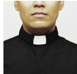
Figure 5a: A priest’s collar.

In some roles, the effort to manage an impression is largely invisible to the audience. Imagine, for example, a security guard at a concert. If everything goes well, the security guard will not have to break up any fights or physically remove anyone from the concert. If a fight does break out, a small individual trained in martial arts might be best-suited to diffusing the situation, but security per-