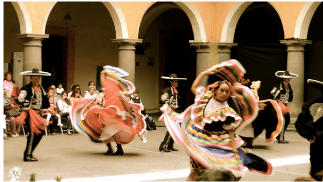
Figure 1: Performance of ballet folklórico in Casa de la Cultura, Puebla, Mexico, 2013.

There is a constant tension between hegemony and agency in our everyday activities. For example, while you choose how you want to dress on a given day, your choice of what to wear is shaped by the social situation. You wear something different at home than you do when going to work, to the beach, to a concert, or on a date. The range of what is considered acceptable attire in