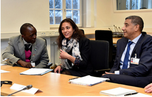
Figure 2: Professional meeting at a 2017 conference on counterterrorism in Norway.