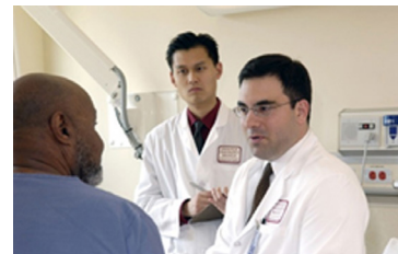
Figure 5b: Doctors’ white lab coats.