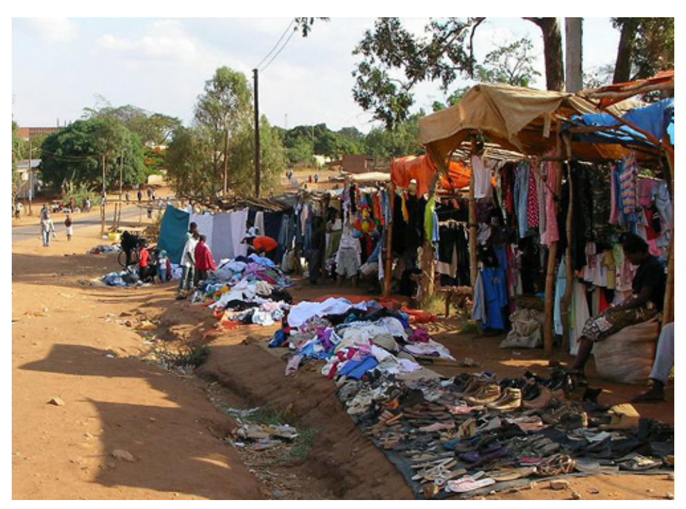
Figure 3: Roadside Salaula trader, Zambia.

for other activities or as a sideline business. Hansen found that there were slightly more female sellers and that women were more likely to be single heads of households. Successful salaula trading requires business acumen and practical skills. Flourishing traders cultivate their consumer knowledge, develop sales strategies, and experiment with display and pricing. While salaula trading has relatively low barriers to entry (one simply has to purchase a bale of clothing from a wholesale importer in order to get started), in this informal market scale is important: salaula moves best when traders have a lot of it on offer. Traders also have to understand the local cultural politics in order to successfully earn a living in this sector. For example, salaula is different from used clothing from people someone knows. In fact, secondhand clothing with folds and wrinkles from the bale is often the most desirable because it is easily identifiable as "genuine" salaula. 16