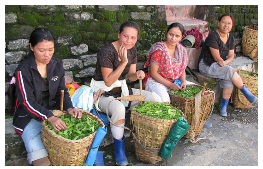
Figure 6: Tea Workers in Darjeeling, India.

from Kentucky, Mezcal can only be produced in certain parts of Mexico, and sparkling wine can only be called champagne if it originated in France. Similarly, in order to legally be sold as "Darjeeling tea," the tea leaves must come from the Darjeeling district of the Indian state of West Bengal.