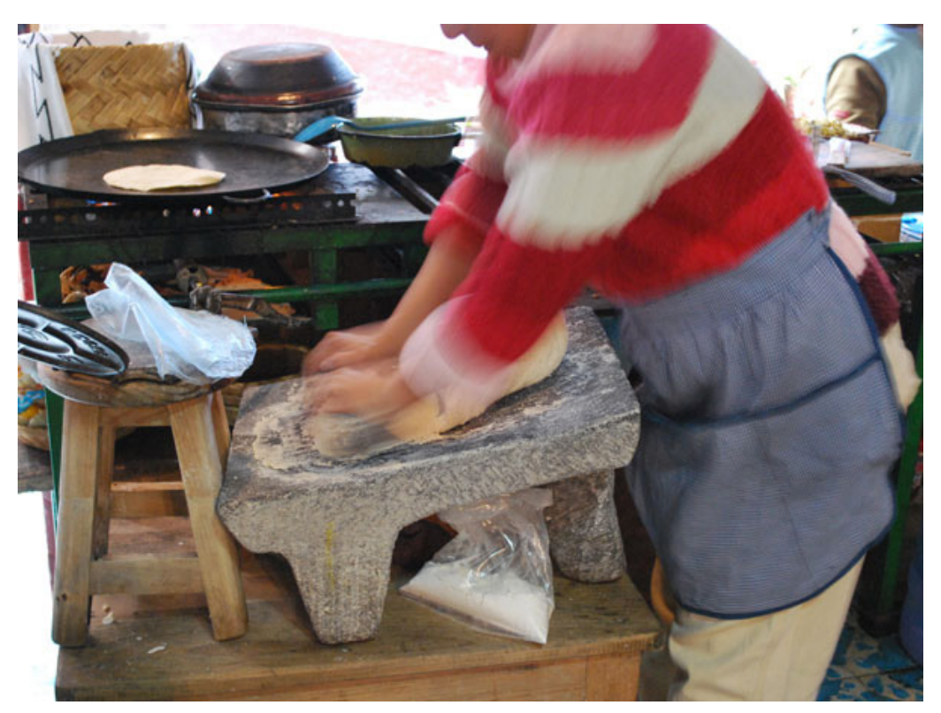
Figure 1: Woman grinding corn with a metate.

and parts of Central America, many indigenous people primarily make their living through small-scale subsistence maize farming. Subsistence farmers produce food for their family's own consumption (rather than to sell). In this family production system, the men generally clear the fields and the whole family works together to plant the seeds. Until the plants sprout, the children spend their days in the fields protecting the newly planted crops. The men then weed the crops and harvest the corn cobs, and, finally, the women work to dry the corn and remove the kernels from the cobs for storage. Over the course of the year mothers and daughters typically grind the corn by hand using a metate , or grinding stone (or, if they are lucky, they might have access to a mechanical grinder). Ultimately, the corn is used to make the daily tortillas the family consumes at each meal. This example demonstrates how the domestic mode of production organizes labor and daily activities within families according to age and gender.