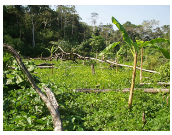
Figure 3: Beans and bananas planted in a swidden field in Acre, Brazil. Note the fallen and burnt logs and the proximity of the forest.

The system breaks down when cleared forests are not allowed to regrow and instead are replaced with industrial agriculture, cattle raising, or logging operations that transform the open fields into pasture or permanent agricultural plots.<sup>13</sup> The system can also break down when small-holders are