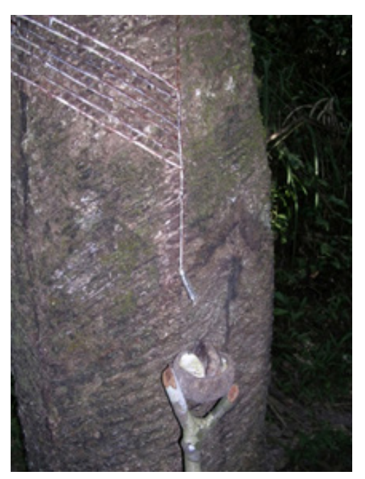
Figure 5: Rubber being tapped from a tree in the Brazilian Amazon.

As with many conservation and development projects, the economic benefits of the extractive reserves were slow to accrue. When rubber prices