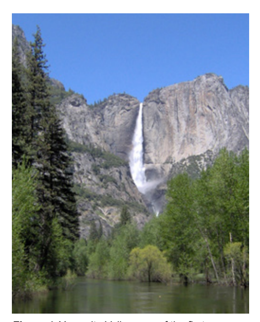
Figure 4: Yosemite Valley, one of the first national parks in the United States, established a precedent of setting aside natural areas for their scenic beauty, recreation, and conservation.

The most common example of a protected area is a national park. In the United States, national parks are so popular that they have been called "America's Best Idea." While I am an enthusiastic fan of national parks, I also recognize problems associated with the concept. We often forget, for example, that the "natural" state of such parks is mostly a recent phenomenon. Many Native American groups were systematically removed from parks (and rarely compensated) to make the parks "natural," and some parks, such as Mt. Rushmore in the Black Hills of South Dakota and Devil's Tower in Wyoming, are directly on top of sacred sites for Native Americans. In other areas of the world, especially in developing countries, most protected areas are occupied by groups of people who have lived there for decades or centuries and have legitimate claims to the land. Some may not be aware that their land is being transformed into a park and, once informed, are shocked by all of the new regulations they are expected to obey. In worst-case scenarios, they are evicted without compensation, be-