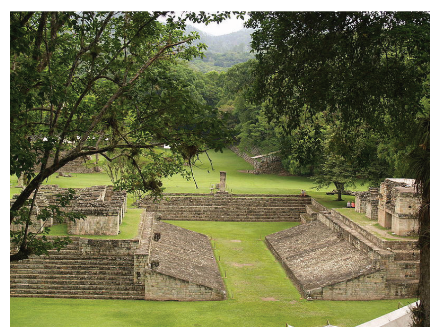
Figure 1: The ball courts at Copan show the complexity and development of early Maya society. Research suggests that deforestation was one of the causes of the collapse of the city-state.

Archaeological evidence of collapses of earlier societies—Harappan cities in the Indus River Valley, the Maya in Central America, and the Rapa Nui of Easter Island, for example—provides a sobering