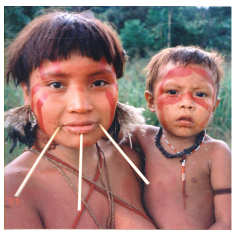
Figure 7: Yanomami Woman and Child, 1997

A more serious and complicated incident concerned research conducted among the Yanomami, an indigenous group living in the Amazon rainforest in Brazil and Venezuela. Starting in the 1960s,