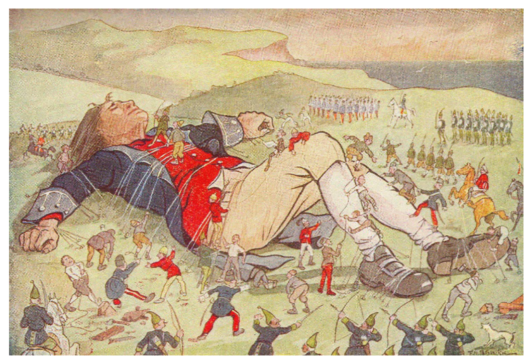
Figure 1: Travel writer Lemuel Gulliver is captured and tied down by the Lilliputians.

suddenly becomes a giant. During this adventure, Gulliver is seen as an outsider, a stranger with different features and language. Gulliver becomes the Other.