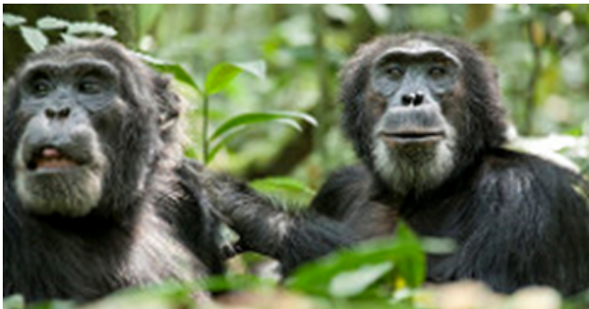
Figure 2. Chimpanzees and other great apes use gesture-call communication systems.

All animals communicate and many animals make meaningful sounds. Others use visual signs, such as facial expressions, color changes, body postures and movements, light (fireflies), or electricity (some eels). Many use the sense of smell and the sense of touch. Most animals use a combination of two or more of these systems in their communication, but their systems are closed systems in that they cannot create new meanings or messages. Human communication is an open system that can easily create new meanings and messages. Most animal communication systems are basically innate; they do not have to learn them, but some species’ systems entail a certain amount of learning. For example, songbirds have the innate ability to produce the typical songs of their species, but most of them must be taught how to do it by older birds.