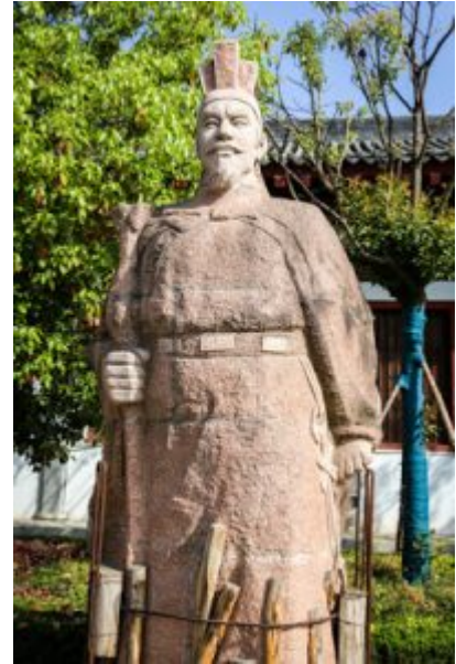
Figure 1: Statue of Zhang Qian in Chenggu, China. Zhang Qian is still celebrated today in China as an important diplomat and pioneer of the silk road.