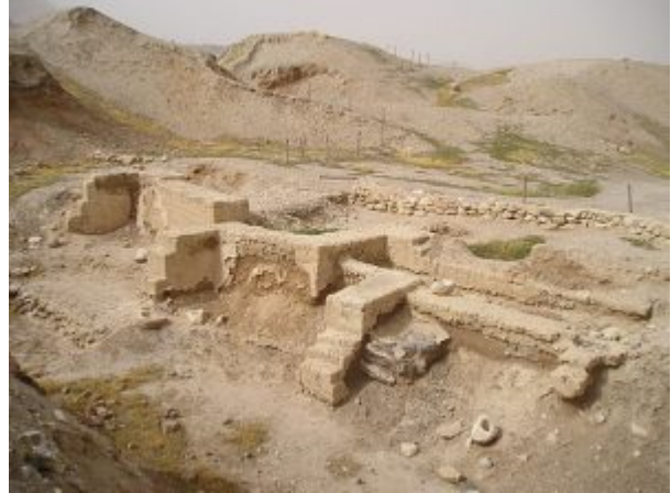
Figure 8: Archaeologists, including Kathleen Kenyon, have helped unearth the foundations of ancient dwellings at Jericho.

The method that archaeologists use to answer their questions is excavation—the careful digging and removing of dirt and stones to uncover material remains while recording their context. Archaeological research spans millions of years from human origins to the present. For example, British archaeologist Kathleen Kenyon (1906-1978), was one of few female archaeologists in the 1940s. She famously studied the city structures and cemeteries of Jericho, an ancient city dating back to the Early Bronze Age (3,200 years before the present) located in what is today the West Bank. Based on her findings, she argued that Jericho is the oldest city in the world and has been continuously occupied by different groups for over 10,000 years (Kenyon 1979).