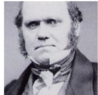
Figure 3: Charles Darwin in 1854, five years before he published The Origin of Species .

For example, geologist Sir Charles Lyell (1797-1875) observed layers of rock and argued that the earth's surface must have changed gradually over long periods of time. He disputed the Young Earth theory, which was popular at the time and used Biblical information to date the earth as only 6,000 years old. Charles Darwin (1809-1882), a naturalist and biologist, observed similarities between fossils and living specimens, leading him to argue that all life is descended from a common ancestor. Philosopher John Locke (1632-1704) contemplated the origins of society itself, proposing that people historically had lived in relative isolation until they agreed to form a society in which the government would protect their personal property.