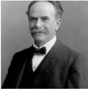
Figure 4: Franz Boas, circa 1915.

isfy the specific biological and psychological needs of its people. While this theory has been critiqued as biological reductionism, it was an early attempt to view other cultures in more open-minded ways.