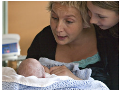
Figure 9: From the moment they are born, children learn through language and nonverbal forms of communication.

Medical anthropology is an example of both an applied and theoretical area of study that draws on all four subdisciplines to understand the interrelationship of health, illness, and culture. Rather than assume that disease resides only within the individual body, medical anthropologists explore the environmental, social, and cultural conditions that impact the experience of illness. For example, in some cultures, people believe illness is caused by an imbalance within the community. Therefore, a communal response, such as a healing ceremony, is necessary to restore both the health of the person and the