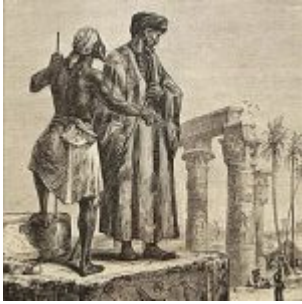
Figure 2. An illustration of Abu Abdullah Muhammad Ibn Battuta in Egypt from Jules Verne's book "Découverte de la terre" (Discovery of the Earth).

Later, from the 1400s through the 1700s, during the so-called "Age of Discovery," Europeans began to explore the world, and then colonize it. Europeans exploited natural resources and human labor in other parts of the world, exerting social and political control over the people they encountered. New trade routes along with the slave trade fueled a growing European empire while forever disrupting previously independent cultures in the Old World. European ethnocentrism —the belief that one's own culture is better than others—was used to justify the subjugation of non-European societies on the alleged basis that these groups were socially and even biologically inferior. Indeed, the emerging anthropological practices of this time were ethnocentric and often supported colonial projects.