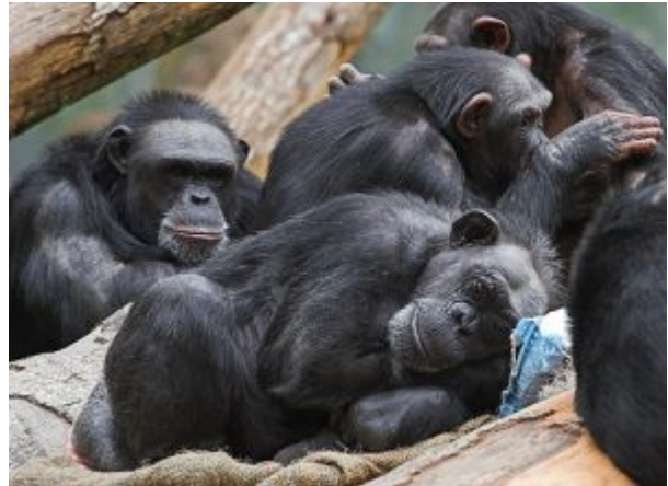
Figure 6: Chimpanzees are the nonhuman primate that are most closely related to humans. We shared a common ancestor with Chimpanzees around 8 million years ago.

Other biological anthropologists focus on humans in the present including their genetic and phenotypic (observable) variation. For instance, Nina Jablonski has conducted research on human skin tone, asking why dark skin pigmentation is prevalent in places, like Central Africa, where there is high ultraviolet (UV) radiation from sunlight, while light skin pigmentation is prevalent in places, like Nordic countries, where there is low UV radiation. She explains this pattern in terms of the interplay between skin pigmentation, UV radiation, folic acid, and vitamin D. In brief, too much UV radiation can break down folic acid, which is essential to DNA and cell production. Dark skin helps block UV, thereby protecting the body's folic