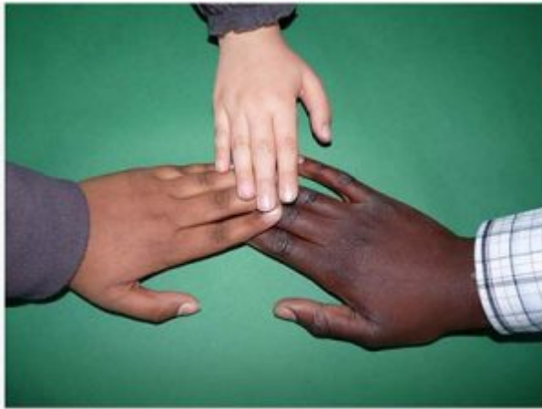
Figure 7: Human skin color ranges from dark brown to light pink.

Other biological anthropologists focus on extinct human species, asking questions like: What did our ancestors look like? What did they eat? When did they start to speak? How did they adapt to new environments? In 2013, a team of women scientists excavated a trove of fossilized bones in the Dinaledi Chamber of the Rising Star Cave system in South Africa. The bones turned out to belong to a previously unknown hominin species that was later named Homo naledi . With over 1,550 specimens from at least fifteen individuals, the site is the largest collection of a single hominin species found in Africa (Berger, 2015). Researchers are still working to determine how the bones were left in the deep, hard to access cave and whether or not they were deliberately placed there. They also want to know what Homo naledi ate, if this species made and used tools, and how they are related to other Homo species. Biological anthropologists who study ancient human relatives are called paleoanthropologists . The field of paleoanthropology changes rapidly as fossil discoveries and refined dating techniques offer new clues into our past.