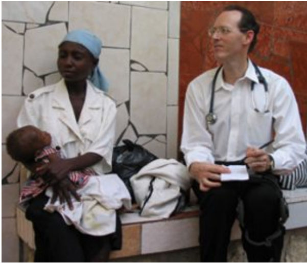
Figure 10: Paul Farmer in Haiti.

group. This approach differs from the one used in mainstream U.S. healthcare, whereby people go to a doctor to find the biological cause of an illness and then take medicine to restore the individual body.