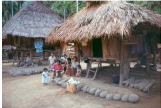
Figure 18: Family members gathered at their home in Ifugao Province, the Philippines.

The particular way that cultural anthropologists do their research is important to our results. Through my research experiences I have participated in the rich daily lives of farmers, woodcarvers, hospital personnel, government employees, shopkeepers, students, and other groups of people. I conducted interviews and surveys and also shared daily and ritual experiences with people to learn about inadequate access to nutritious food, and social structural sources of this kind of health problem. Participant observation research allows anthropologists to obtain a special kind of knowledge that is rarely acquired through other, more limited research methods. This type of research takes a great amount of time and effort, but produces a uniquely deep and contextual type of knowledge. Ethnographic research can help us to understand the extent of a global problem such as gender violence, the everyday experiences of those facing abuse, and the struggles and accomplishments of people actively working to improve their societies.