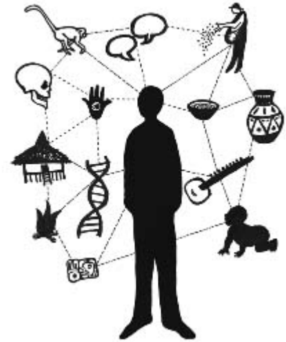
Figure 11: By using a holistic approach, anthropologists learn how different aspects of humanity interact with and influence one another. Image by Mary Nelson.

Anthropologists are interested in the whole of humanity, in how various aspects of life interact. One cannot fully appreciate what it means to be human by studying a single aspect of our complex histories, languages, bodies, or societies. By using a holistic approach, anthropologists ask how different aspects of human life influence one another. For example, a cultural anthropologist studying the meaning of marriage in a small village in India might consider local gender norms, existing family networks, laws regarding marriage, religious rules, and economic factors. A biological anthropologist studying monkeys in South America might consider the species' physical adaptations, foraging patterns, ecological conditions, and interactions with humans in order to answer questions about their social behaviors. By understanding how nonhuman primates behave, we discover more about ourselves (after all, humans are primates)! By using a holistic approach, anthropologists reveal the complexity of biological, social, or cultural phenomena.