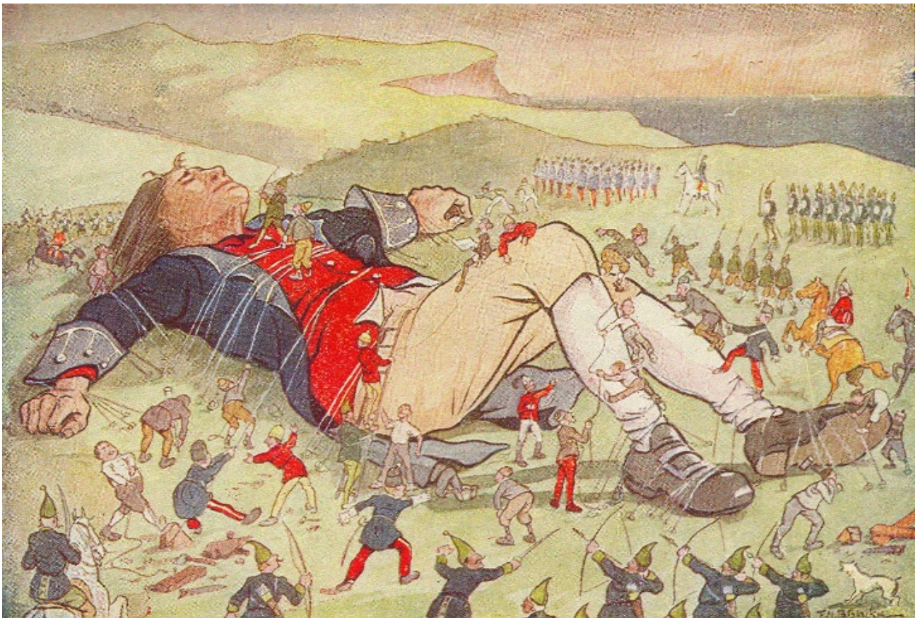
Travel writer Lemuel Gulliver is captured and tied down by the Lilliputians.

A fable becomes a tradition by being retold and accepted by others in the community. Different cultures have very similar stories sharing common themes. One of the most common themes is the battle between good and evil. Another is the story of the quest. The quest often takes the character to distant lands, filled with real-life situations, opportunities, hardships, and heartaches. In both of these types of stories, the reader is introduced to the anthropological concept known as the Other . What exactly is the Other ? The Other is a term that has been used to describe people whose customs, beliefs, or behaviors are “different” from one’s own.