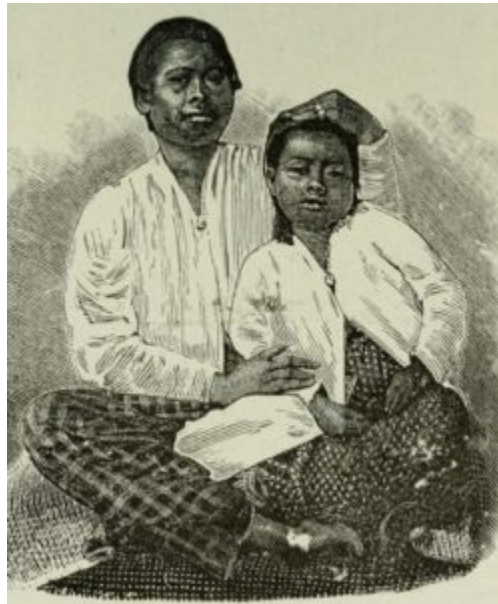
Drawing of a Mother and Child in Malaysia From Anthropology: An Introduction to the Study of Man and Civilization , E.B. Tylor, 1904

morals, custom, and any other capabilities and habits acquired by man as a member of society." 1 His definition of culture is still used frequently today and remains the foundation to the culture concept in anthropology.