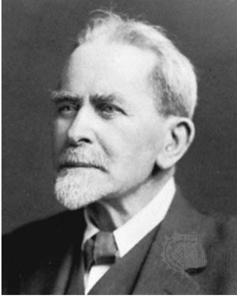
Sir James Frazer is among the founders of modern anthropology.

Armchair anthropologists were unlikely to be aware of their ethnocentric ideas because they did not visit the cultures they studied. Scottish social anthropologist Sir James Frazer is well-known for his 1890 work The Golden Bough: A Study of Comparative Religions . Its title was later changed to A Study in Magic and Religion , and it was one of the first books to describe and record magical and religious beliefs of different culture groups around the world. Yet, this book was not the outcome of extensive study in the field. Instead, Frazer relied on the accounts of others who had traveled, such as scholars, missionaries, and government officials, to formulate his study.