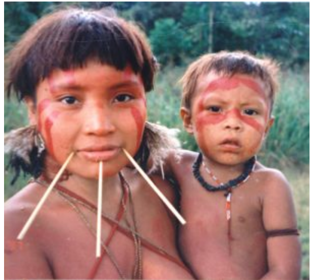
Yanomami Woman and Child, 1997

debate over this episode continues. 8 The controversy demonstrates the extent to which truth can be elusive in anthropological inquiry. Although anthropologists should not be storytellers in the sense that they deliberately create fictions, differences in perspective and theoretical orientation create unavoidable differences in the way anthropologists interpret the same situation. Anthropologists must try to use their toolkit of theory and methods to ensure that the stories they tell are truthful and represent the voice of the people being studied using an ethical approach.