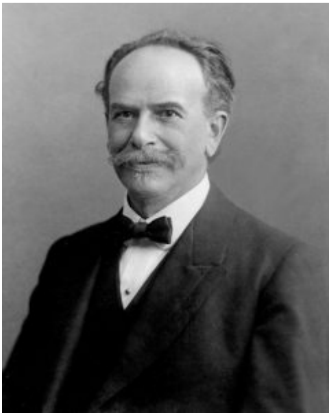
Franz Boas, One of the Founders of American Anthropology, 1915

The participant-observation method of fieldwork was a revolutionary change to the practice of anthropology, but at the same time it presented problems that needed to be overcome. The challenge was to move away from ethnocentrism, race stereotypes, and colonial attitudes, and to move forward by encouraging anthropologists to maintain high ethical standards and open minds.