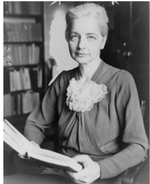
Ruth Benedict, 1936

Kroeber and others also established the importance of language as an element of culture and documented the ways in which language was used to communicate complex ideas. By the late twentieth century, new approaches to symbolic anthropology put language at the center of analysis. Later on, Clifford Geertz, the founding member of postmodernist anthropology, noted in his book The Interpretation of Cultures (1973) that culture should not be seen as something that was "locked inside people's heads." Instead, culture was publically communicated through speech and other behaviors. Culture , he concluded, is "an historically transmitted pattern of meanings embodied in symbols, a system of inherited conceptions expressed in symbolic forms by means of which men communicate, perpetuate, and