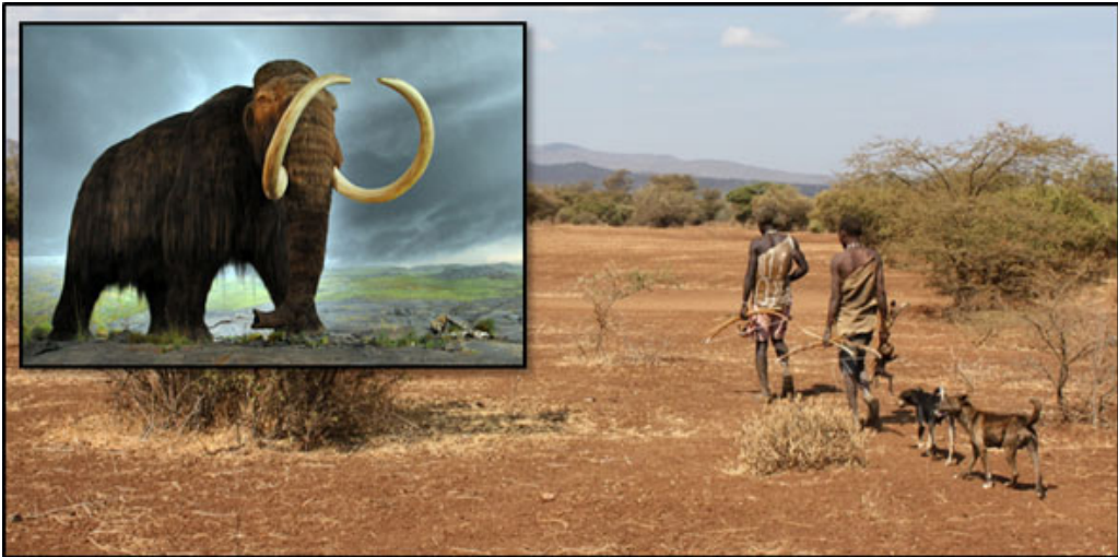
Figure 3: The woolly mammoth was hunted to extinction in North America at the end of the last ice age. It is possible that dogs played a role in hunting these and other large game animals.

humans who relied on hunting the Ice Age megafauna such as woolly mammoths. Dogs played such a critical role in hunting that some archaeologists believe they may have contributed to the eventual extinction of the woolly mammoths. 14 Dogs were also valued for their role as watchdogs capable of protecting the community from predators and invaders.