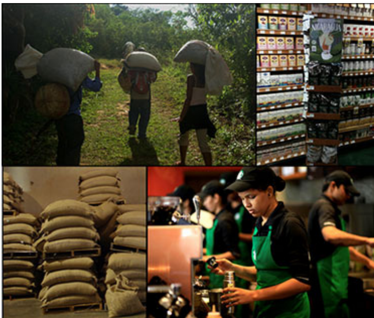
Figure 9: Links in the Commodity Chain for Coffee: As the coffee changes hands from the growers, to the exporters, to the importers, and then to the retail distributors, the value of the coffee increases. Consider the differences in wage between these workers.

The commodity chain for agricultural products begins in the farms where plant and animal foods are produced. Farmers generally do not sell their produce directly to consumers, but instead sell to large food processors that refine the food into a more useable form. Coffee beans, for instance, must be roasted before they can be sold. Following processing, food moves to wholesalers who will package it for sale to retail establishments like grocery stores. As foods move through the commodity chain,