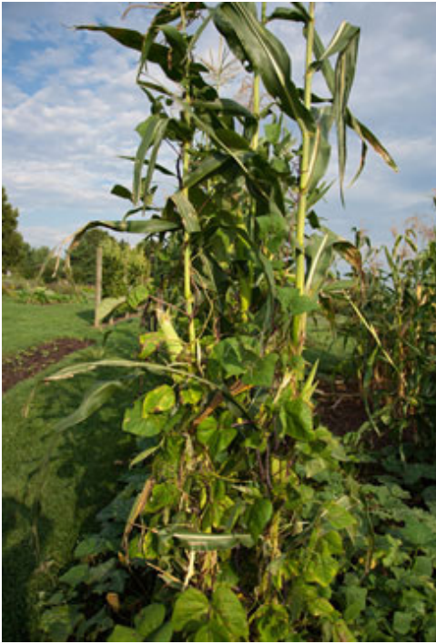
Figure 5: Bean plants grow up the stalk of a corn plant, while squash vines grow along the ground between corn stalks, inhibiting weed growth, an innovative technique developed by indigenous farmers in the Americas thousands of years ago.

Growing crops in the same location for several seasons leads to depletion of the nutrients in the soil as well as a concentration of insects and other pests and plant diseases. In agricultural systems like the one used in the United States, these problems are addressed through the use of fertilizers, pesticides, irrigation, and other technologies that can increase crop yields even in bad conditions. Horticulturalists respond to these problems by moving their farm fields to new locations. Often this means clearing a section of the forest to make room for a new garden, a task many horticulturalists accomplish by cutting down trees and setting controlled fires to burn away the undergrowth. This approach, sometimes referred to as “slash-and-burn,” sounds destructive and has often been criticized, but the ecological impact is complex. Once abandoned, farm fields immediately begin to return to a forested state; over time, the quality of the soil is renewed. Farmers often return after several years to reuse a former field, and this recycling of farmland reduces the amount of forest that is disturbed. While they may relocate their farm fields with regularity, horticulturalists tend not to move their residences, so they rotate through