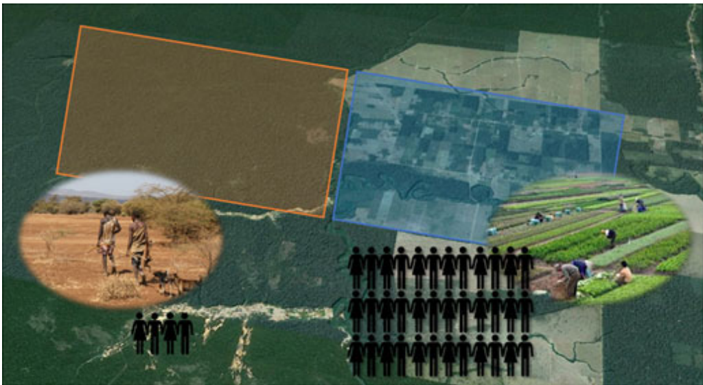
Figure 1: Carrying Capacity: The area in the orange box, which is not under cultivation, might provide enough resources for a family of four to survive for a year. An equivalent area, marked by the blue box, could provide enough resources for a significantly larger population under intensive agricultural cultivation.

order to survive. Anthropologists use the term carrying capacity to quantify the number of calories that can be extracted from a particular unit of land to support a human population. In his 1798 publication An Essay on the Principle of Population , Thomas Malthus argued, “the power of population is indefinitely greater than the power in the earth to produce subsistence for man.” 1 He suggested that human populations grow at an exponential rate, meaning the population climbs at a rate that is constantly increasing. However, the availability of resources in the environment increases at only an arithmetic rate, which means that left unchecked human populations would soon outstrip the environment’s ability to provide sustenance. Malthus famously argued that war, famine, and disease were “good” or at least “functional” in the sense that they kept populations from growing too large.