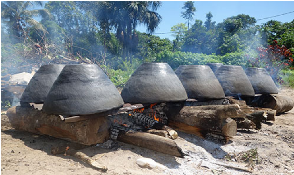
Figure 7: Clay Cooking Pots in the Republic of Suriname.