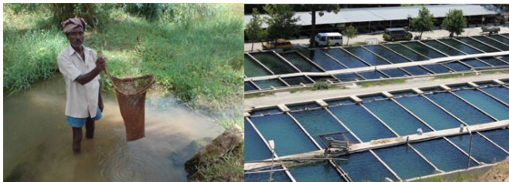
Figure 2: These images show how fish are harvested in two different subsistence systems. Consider the amount of investment and labor that went into the development of technologies that make mass fish farming, or aquaculture, possible compared to fishing with simple nets.

person might catch the fish, distribute some extra to friends and family, and then consume the bounty that same day. In a city, the consumer of the fish at a fancy restaurant is not the same person who caught the fish. In fact, that person almost certainly has no knowledge of who caught, cleaned, distributed, and prepared the fish he or she is consuming. The web of social connections that we can trace through subsistence provide a very particular kind of anthropological insight into how societies function at their most basic level.