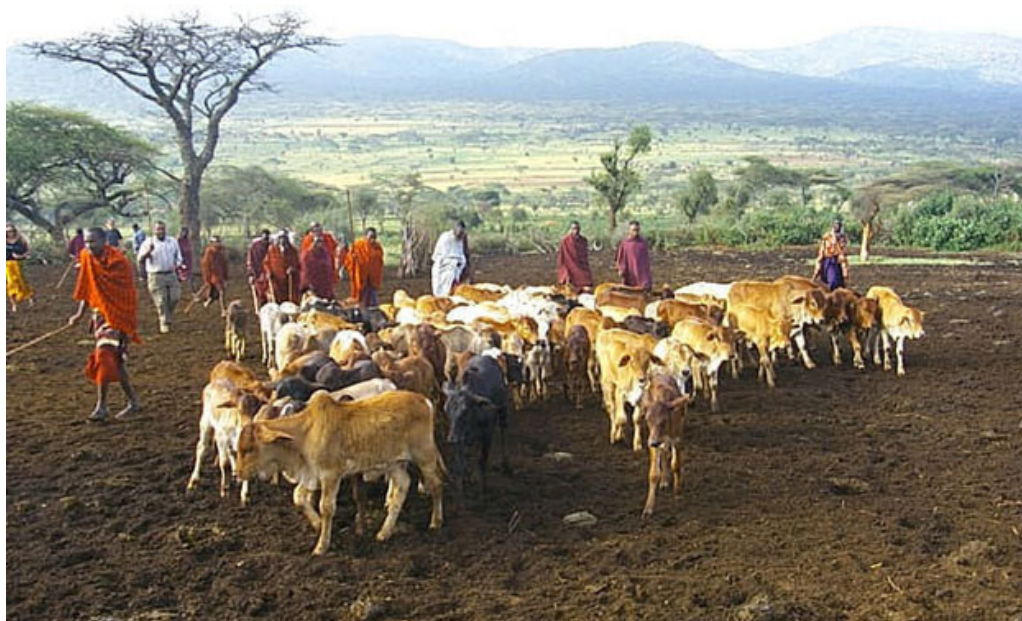
Figure 4: A Typical Maasai Herd: Although women do most of the work of tending the herd, only men are allowed to own cattle

pastoralists is not to produce animals to slaughter for meat, but instead to use other resources such as milk, which can be transformed into butter, yogurt, and cheese, or products like fur or wool, which can be sold. Even animal dung is useful as an alternate source of fuel and can be used as an architectural product to seal the roofs of houses. In some pastoral societies, milk and milk products comprise between 60 and 65 percent of the total caloric intake. However, very few, if any, pastoralist groups survive by eating only animal products. Trade with neighboring farming communities helps pastoralists obtain a more balanced diet and gives them access to grain and other items they do not produce on their own.