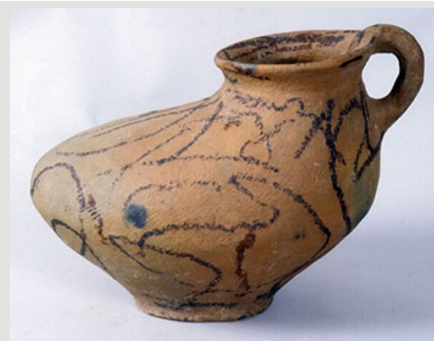
Figure 6: A Culinary Shoe Pot from Oaxaca, Mexico. Courtesy of the Burke Museum of Natural History and Culture, Catalog Number 2009–117/536

Archaeological studies in Central America have revealed that the invention of pottery was the technological breakthrough needed to boil beans. A particular type of pottery known as the “culinary shoe pot” was one of these technological innovations. The pots are used by placing the “foot” of the pot in the coals of a fire so heat can be transmitted through the vessel for long periods of time. Pots of this design have been found in the archaeological record throughout Central America in sites dating to the same period as the beginning of bean domestication and pots of similar design continue to be used throughout that region today. This example demonstrates the extent to which the expansion of the human diet has been linked to innovations in other areas of culture.