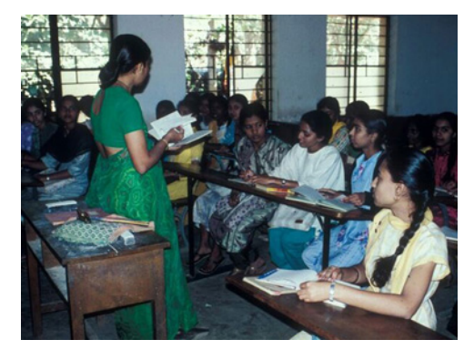
Figure 6: All-girls' school in Bangalore, India. Photograph by Carol Mukhopadhyay, 1989.