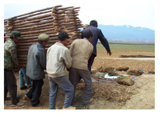
Figure 11: Na men carry a wooden structure to be used at a funeral.