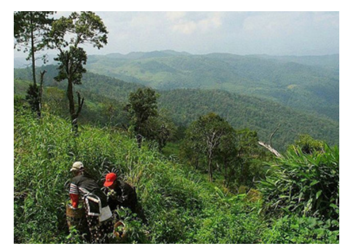
Figure 9: Lahu farmers in Chiangmai, Thailand.

Like the Lahu, the nearby Na believe men and women both play crucial roles in a family and household. Women are associated with birth and life while men take on tasks such as butchering animals and preparing for funerals (Figures 10 and 11). Every Na house has two large pillars in the central hearth room, one representing male identity and one representing female identity. Both are crucial, and the house might well topple symbolically without both pillars. As sociologist Zhou Huashan explained in