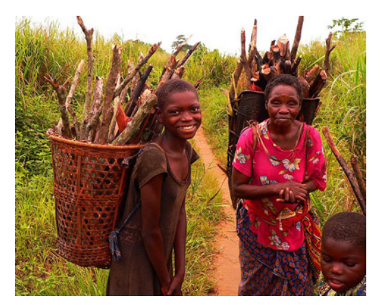
Figure 17: Collecting firewood in Bansankusu, Democratic Republic of Congo.

Nor is it just hunting that requires intelligence, planning, cooperation, and detailed knowledge. Foragers have lived in a wide variety of environments across the globe, some more challenging than others (such as Alaska). In all of these groups, both males and females have needed and have developed intensive detailed knowledge of local flora and fauna and strategies for using those resources. Human social interactions also require sophisticated mental and communication skills, both verbal and nonverbal. In short, humans' complex brains and other modern traits developed as an adaptation to complex social life, a lengthy period of child-dependency