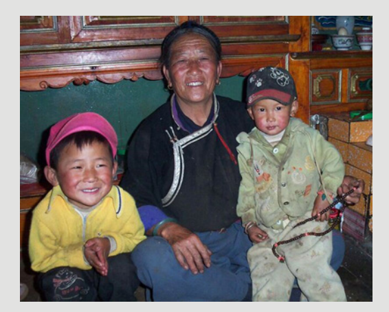
Figure 18: Na grandmother with her maternal grandchildren. They live in the same household, along with the grandmother's adult sons and her daughter, the children's mother. Photograph by Tami Blumenfield, 2002.

the preceding two systems. Someone joins a larger household as a spouse. Perhaps the family lacked enough women or men to manage the household and farming tasks adequately or the couple faced pressure from the government to marry.