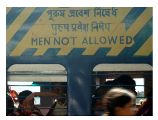
Figure 5: A women only train car in India. Photograph by Ajay Tallam, 2007.

Of course, it is impossible to separate the genders completely. Rural women pass through the more-public spaces of a village to fetch water and firewood and to work in agricultural fields. Women shop in public markets, though that can be a "man's job." As girls more often attend school, as in India, they take public transportation and thus travel through public "male" spaces even if they travel to all-girl schools (Figure 6). At college, they can be immersed in and even live on campuses where men predominate, especially if they are studying engineering, computer science, or other technical subjects