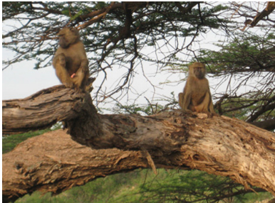
Figure 14: Baboon pair in tree: malefemale voluntary relations. Photograph by Carol Mukhopadhyay, Tanzania, 2010.

jor role in this story. Crucial components include: a diet consisting primarily of meat, obtained through planned, cooperative hunts, by all-male groups, that lasted several days and covered a wide territory. Such hunts would require persistence, skill, and physical stamina; tool kits to kill, butcher, transport, preserve, and share the meat; and a social organization consisting of a stable home base and a monogamous nuclear family. Several biological changes were attributed to adopting this way of life: a larger and more complex brain, human language, an upright posture (and humans' unique foot and stride), loss of body hair, a long period of infant dependency, and the absence of "estrus" (ovulation-related female sexual arousal) (Figure 13), which made females sexually "receptive" throughout the monthly cycle. Other human characteristics purportedly made sex more enjoyable: frontal sex and fleshier breasts, buttocks, and genitals, especially the human penis. Making sex "sexier," some speculated, cemented the pair-bond, helping to keep the man "around" and the family unit stable.47