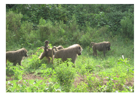
Figure 16: Baboon group with infants being carried by female. Photograph by Carol Mukhopadhyay, Tanzania, 2010.

boons living in other environments by primatologists such as Thelma Rowell discovered that those baboons were neither male-focused nor male-dominated. Instead, the stable group core was matrifocal —a mother and her offspring constituted the central and enduring ties. Nor did males control female sexuality. Quite the contrary in fact. Females mated freely and frequently, choosing males of all ages, sometimes establishing special relationships—"friends with favors." Dominance, while infrequent, was not based simply on size or strength; it was learned, situational, and often stress-induced. And like other primates, both male and female baboons used sophisticated strategies, dubbed "primate politics," to predict and manipulate the intricate social networks in which they lived.<sup>55</sup>