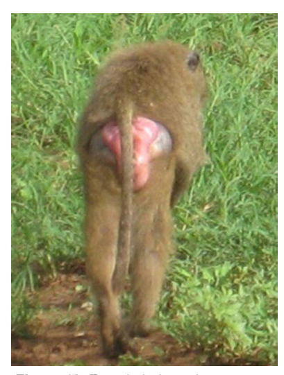
Figure 13: Female baboon in estrus. Photograph by Carol Mukhopadhyay, Tanzania, 2010.

The most popular and persistent theories argued that male dominance is universal, rooted in species-wide gendered biological traits that we acquired, first as part of our primate heritage, and further developed as we evolved from apes into humans. Emergence of "the hunting way of life" plays a ma-